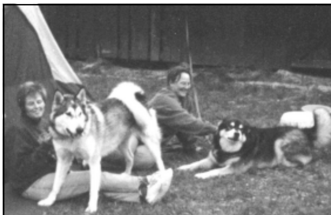
Getting into the spirit, these two campers are ready to enjoy the weekend with their dogs.

Many people did arrive on Friday night so they wouldn't miss any of Saturday's activities, which began at [Continued on Page 4]